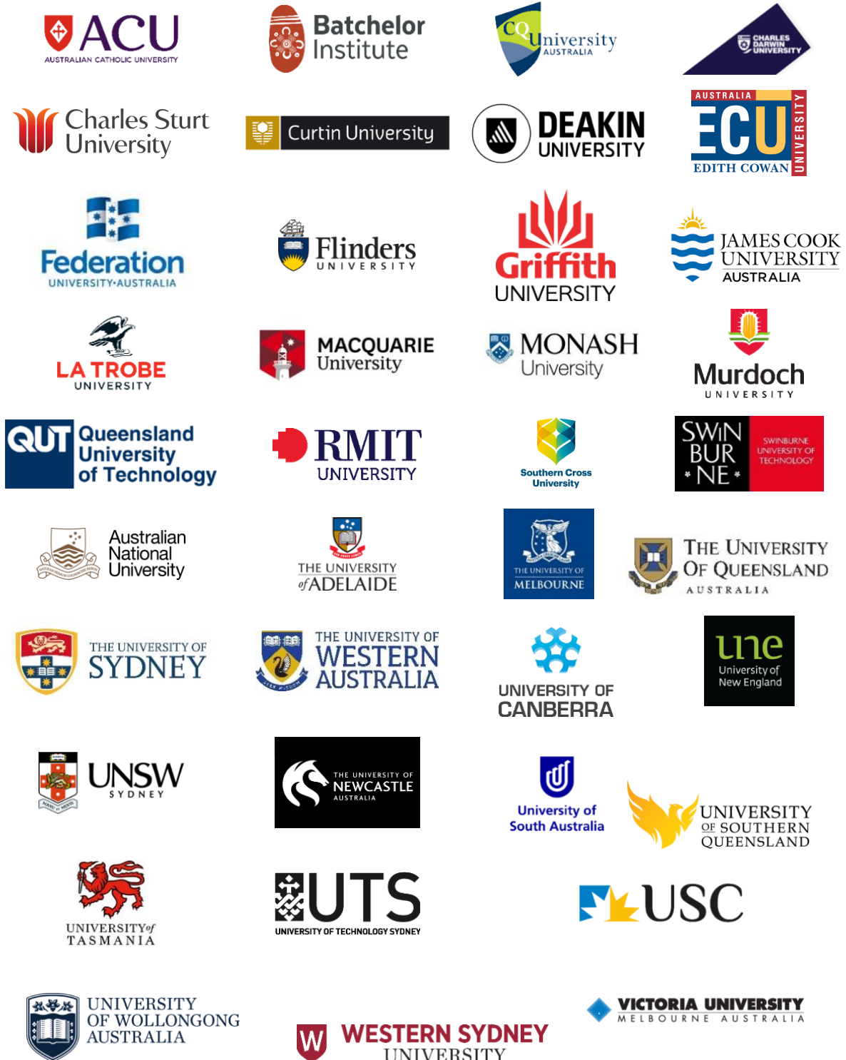
TABLE B PROVIDERS